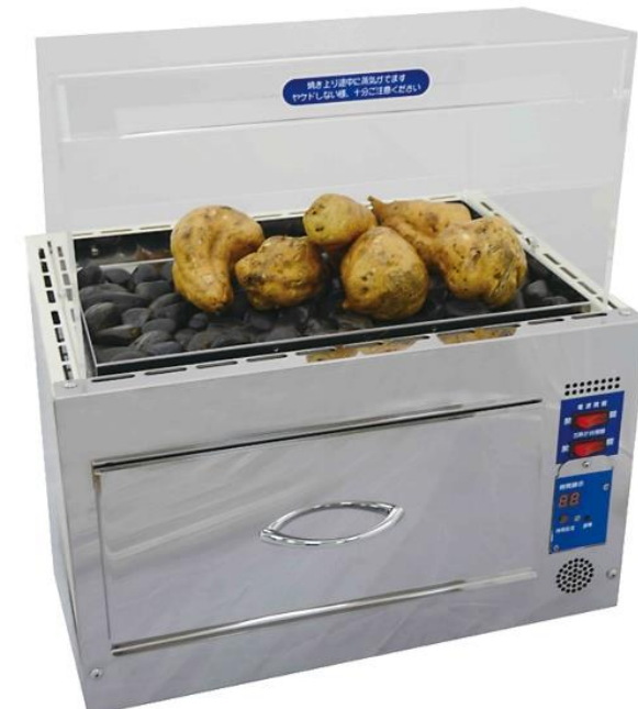
Sweet potato roasting machine