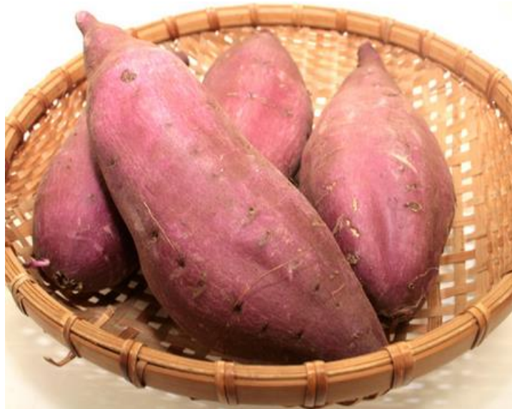
Sweet potato (Fresh)