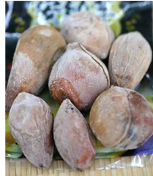
Roasted Sweet potato (Frozen)